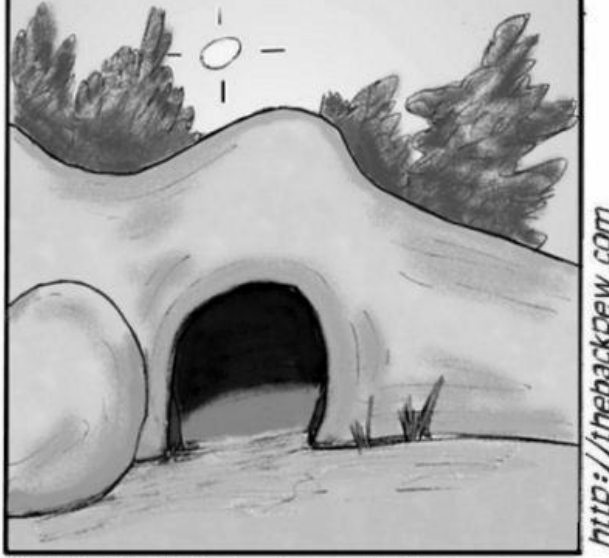
CSI EMPTY TOMB - Grave Robbery or Risen Savior. Fact: Stone rolled away from entrance. Fact: Grave site guards missing. Fact: Burial clothes folded neatly Fact: No signs of tampering. Fact: Jesus body is missing.